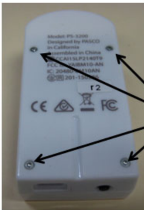
Torx T5 Screw, 4 Places

Step 1: Position the Sensor on a surface as shown. Note the location of the (4) Torx T5 Screws.