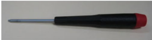
Torx T5 Driver

Use Electrostatic Discharge Protective Handling Procedures.