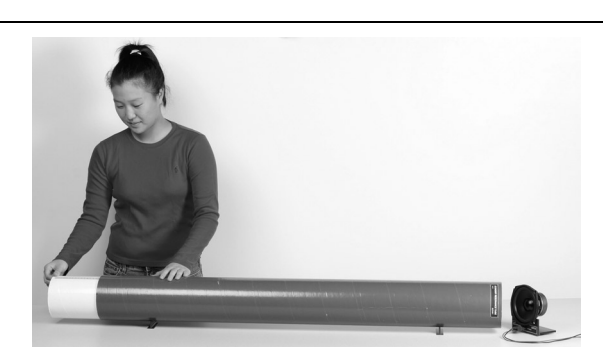
Figure 1: Placement of Resonance Tube relative to the Open Speaker