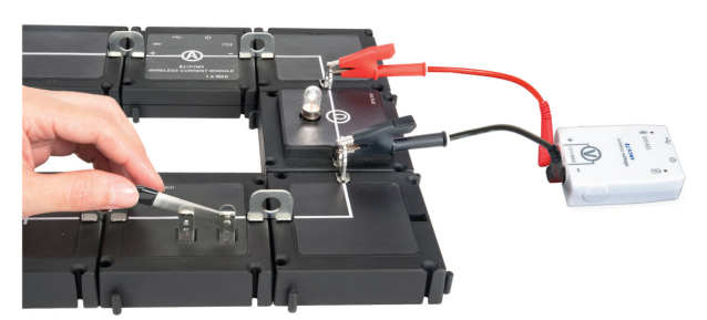
Figure 1: The Wireless Voltage Sensor connected in parallel to a circuit.

drop" across the bulb. The red test lead should be connected to the side closer to the high potential source, and the black test lead should be connected to the side closer to the low potential source, as shown in Figure 2.