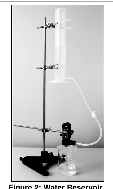
Figure 2: Water Reservoir on rod stand

Note: The fittings on the Water Reservoir are oversized to reduce friction and maximize water flow. If you have difficulty inserting the tubing to the fitting, apply a small amount of glycerine to the tubing.